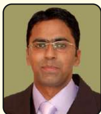
Authored by: CA Bosco D'Souza Nagpur.