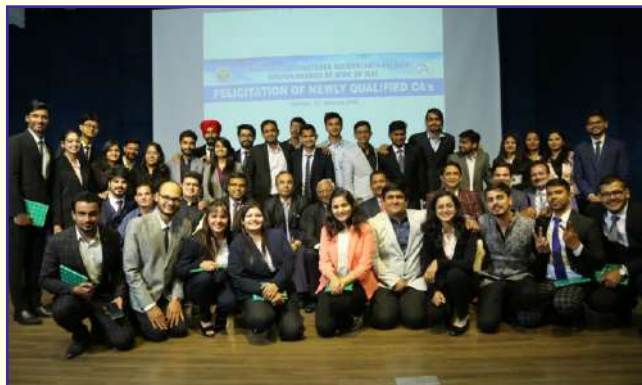
Group Photograph Glimpse of New Entrants to CA Pariwar

Felicitation Programme of Newly qualified CAs dt. 15/02/2020