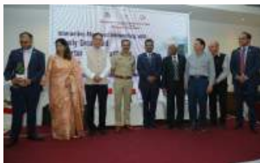
Interactive Meet with Newly Qualified CA's