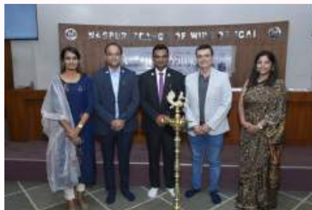
Seminar on Registration of NBFC & Understanding It's ECO System and Designing of ESOP Scheme