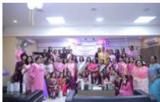
Seminar on Financial Tax Literacy