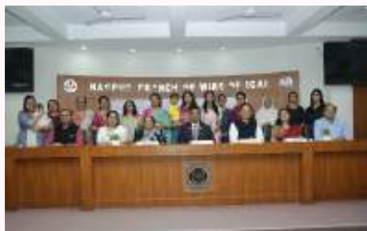
Womanifest - Celebration of International Women's Day